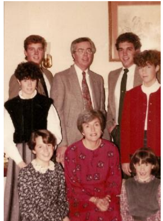
Flanagan Family 1983