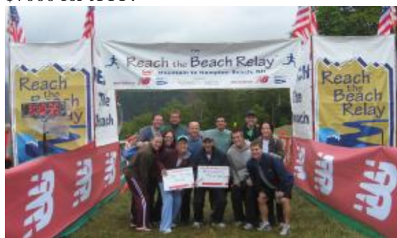
Team Flanagan at Reach the Beach Relay, Hampton, NH