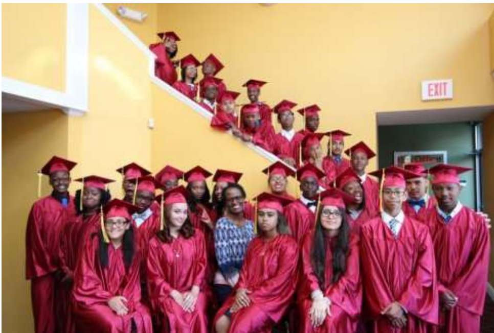
New Beginnings Family Academy Class of 2016