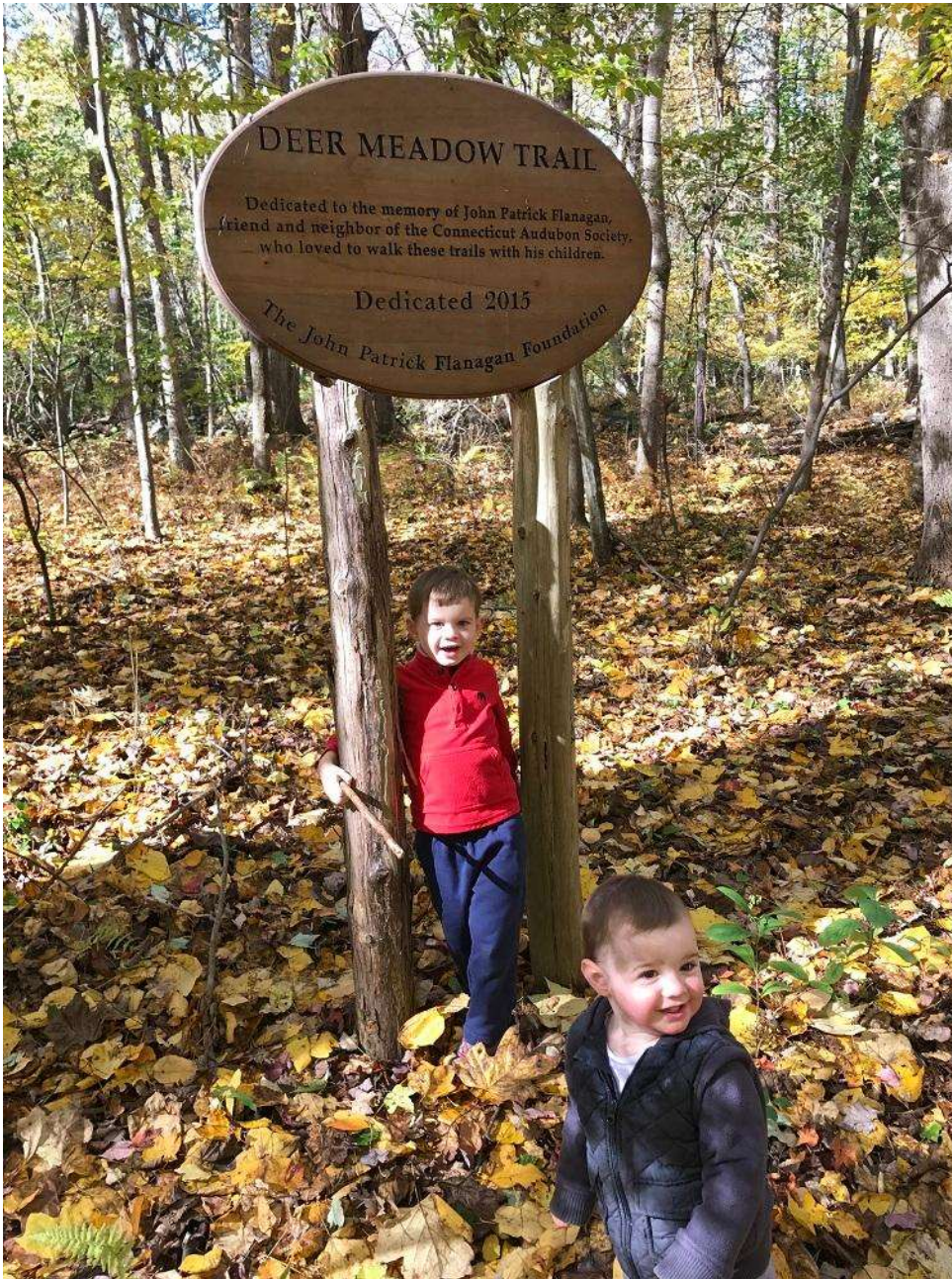
The DiTrapano boys on a family hike at the Burr Street Sanctuary